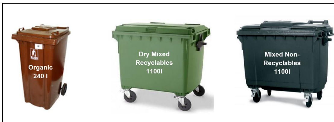
Figure 5.1 Typical waste receptacles of varying size (240L and 1100L)