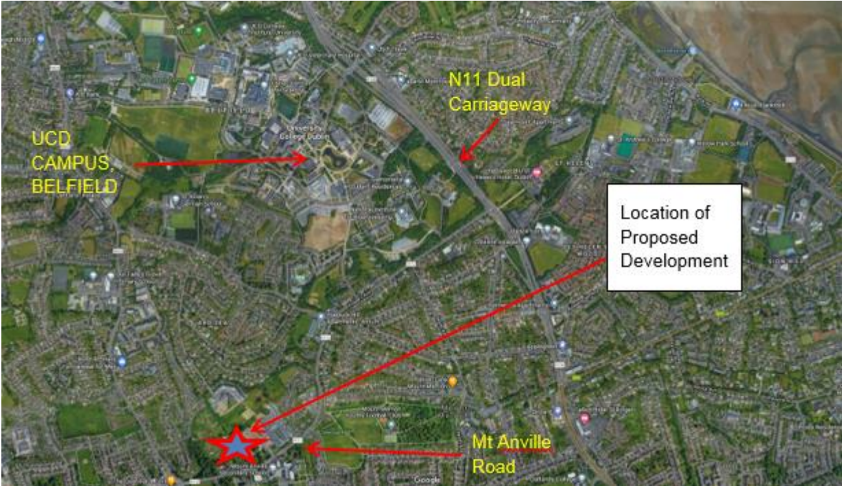
Figure 1 | Site Location (Google Maps)

Refer to Figure 1 for the location of the proposed development.