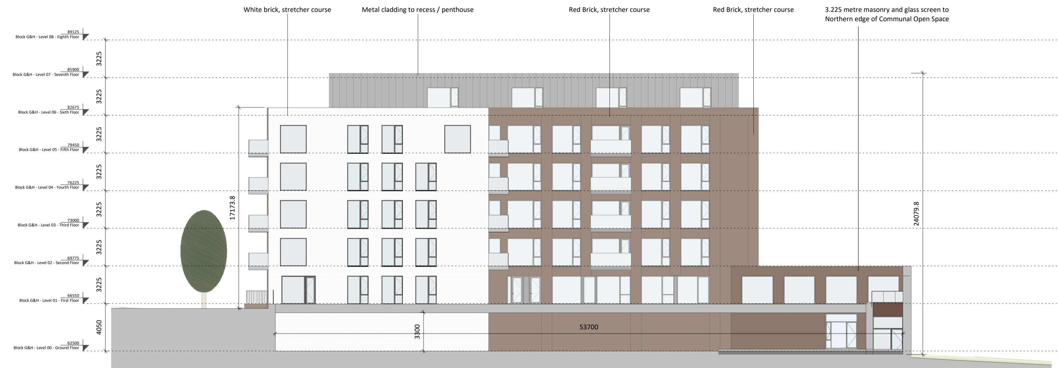
2 Block G&H Section 2 1 : 200