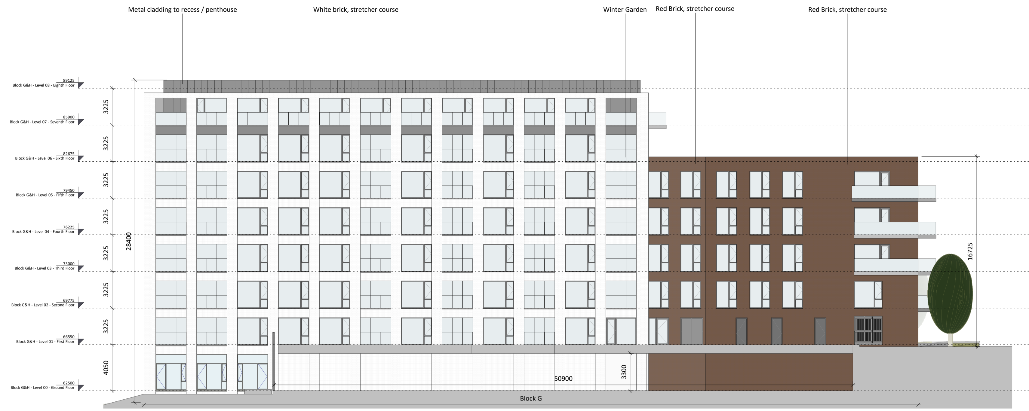
1 Block G&H Section 1 1 : 200